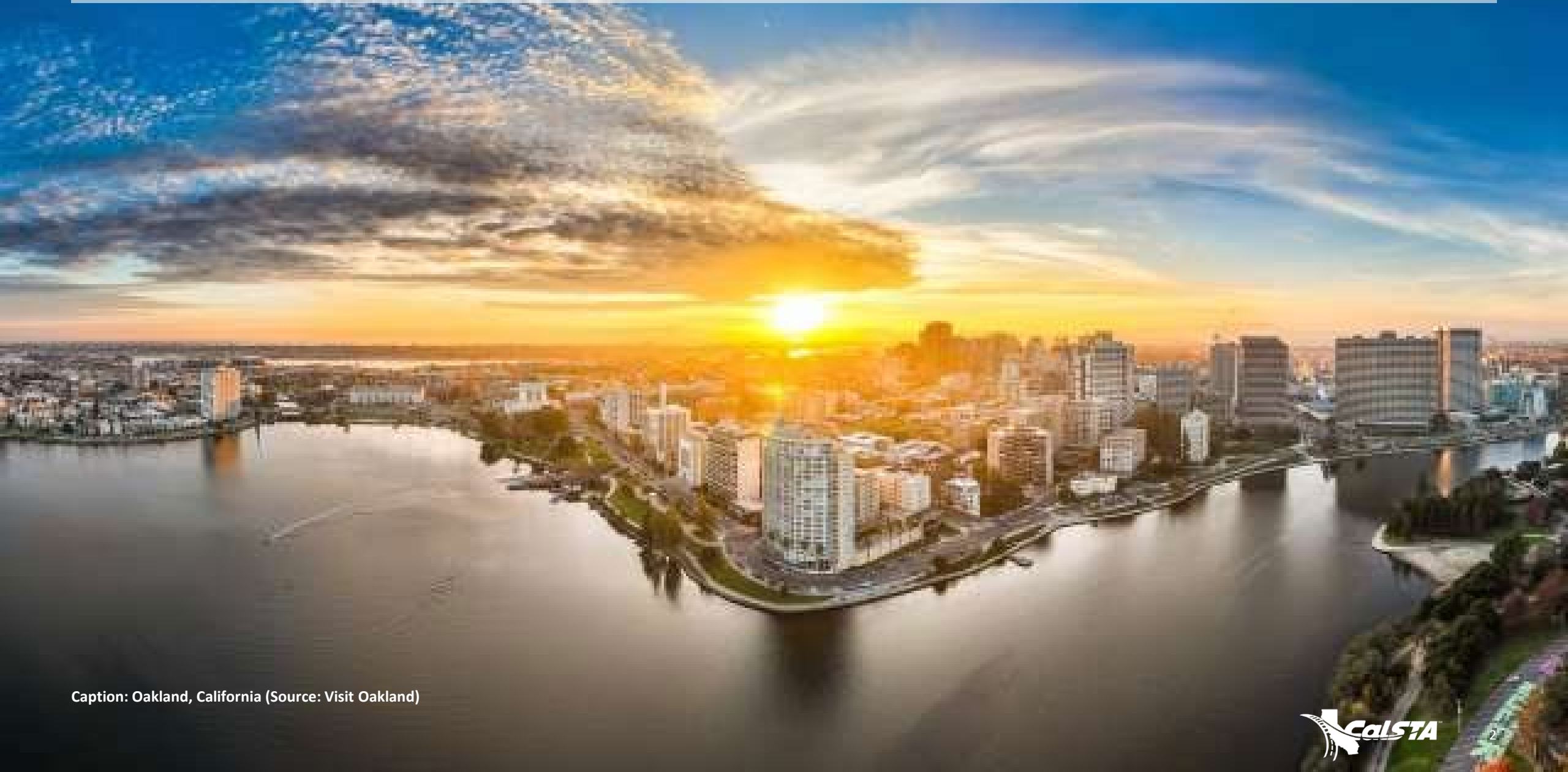
Caption: Oakland, California