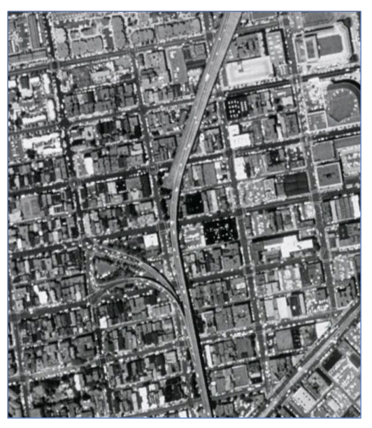
Before – Central Freeway in 1987