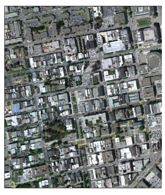
After – Replaced by Octavia Boulevard in 2002