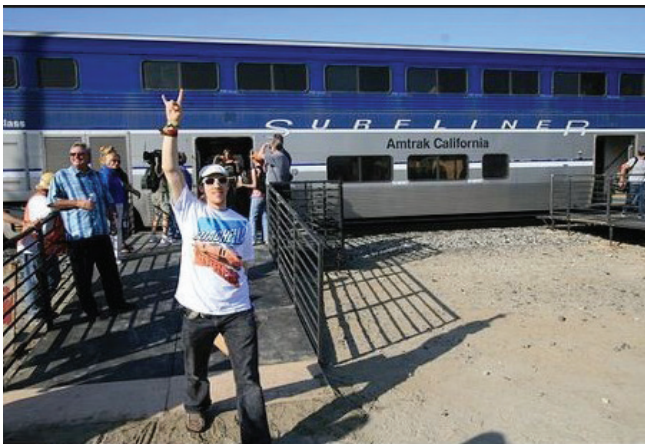
Coachella Event Train Service 2008

The Riverside County Transportation Commission (RCTC) has been studying passenger service along rail corridor alignments between Los Angeles Union Station and Indio, CA since 1991 and was instrumental in having a corridor alignment identified in the 2014 California State Rail Plan update. Since that time, Caltrans Division of Rail in partnership with the FRA and RCTC have also undertaken the development of a Tier 1 EIS/R and Service Development Plan (SDP).