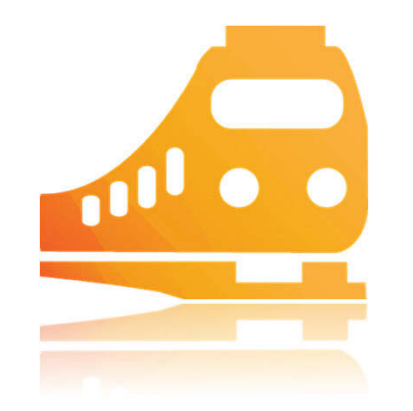
Building towards an integrated, statewide rail and transit network