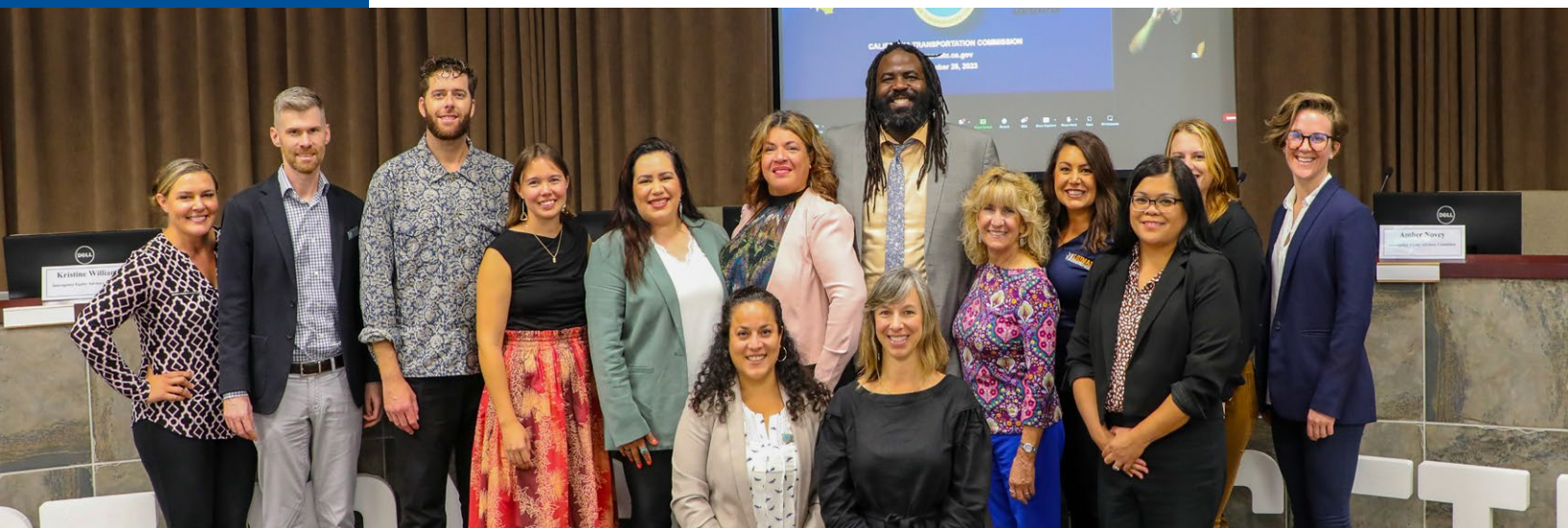
Members of the Interagency Transportation Equity Advisory Committee